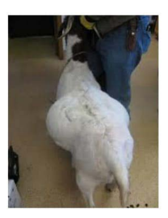
: Bloat/ Tympanitis in Goat

(d) ANEAMIA : the animal show pale mucus membrane, rough and dry hair coat, poor feed taken, weakness, red coloururine, swelling of face & head.