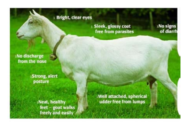
A Healthy Goat

Farmers should have generalize familiarity with the look and condition of health as well as sick animal.