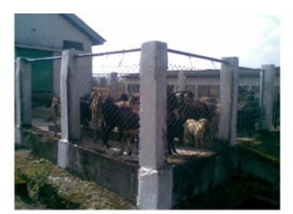
An Open Paddock