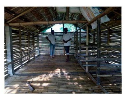
A low-cost Goat Shed made of Bamboo and thatch