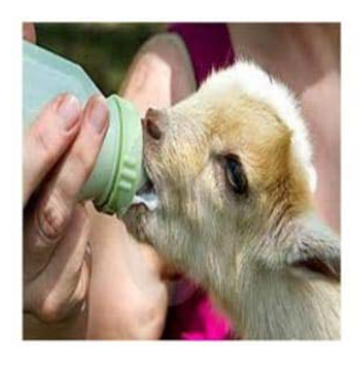
(e) I count of this should be @ /4 of body weight.