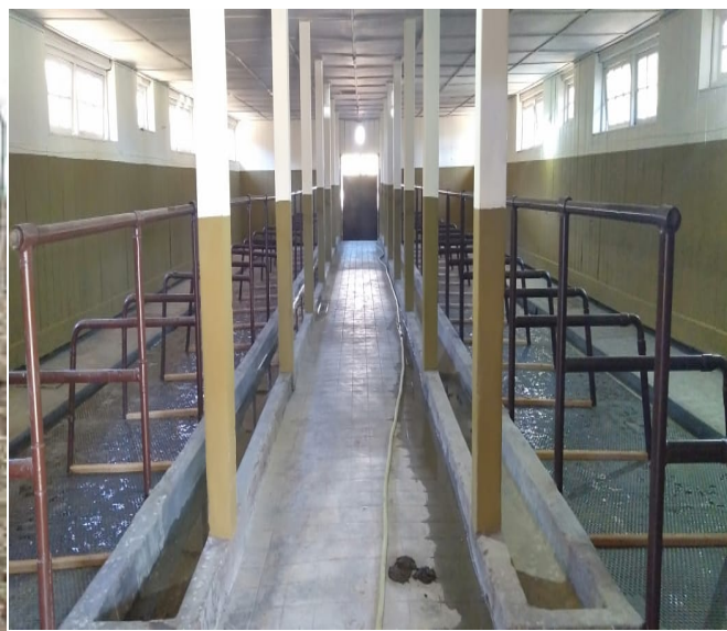
HEAD-TO-HEAD SYSTEM OF HOUSING