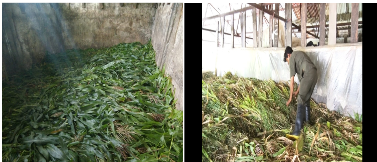
MAIZE PLANT ARRANGED IN PROPER ALIGNMENT FOR SILAGE PREPARATION