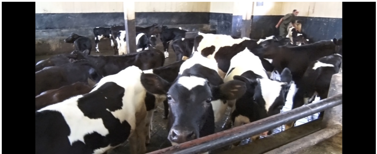
OPEN & COVERED AREA FOR CALVES