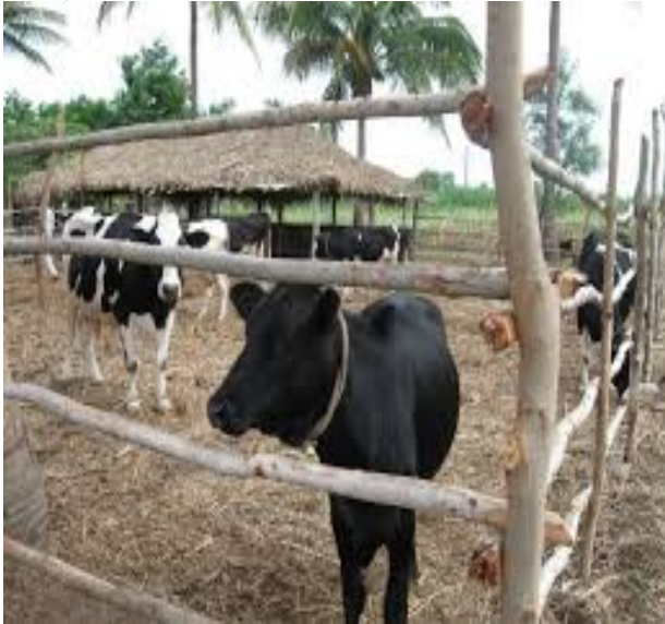
LOOSE SYSTEM OF HOUSING