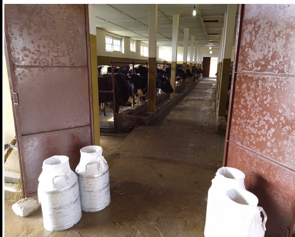
REMOVAL OF MANURE PRIOR TO MILKING